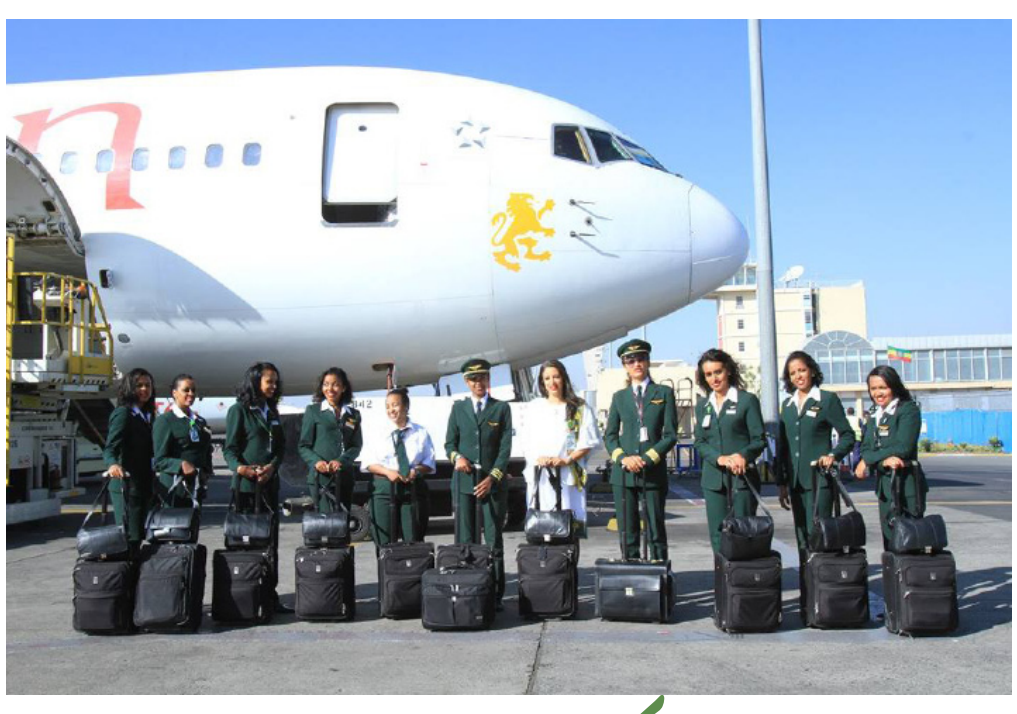
Arrival from Bangkok

This historic flight was aimed at crystalizing Ethiopian corporate conviction of "Women Empowerment for a Sustainable Growth" on the eve of our 70 year Anniversary.