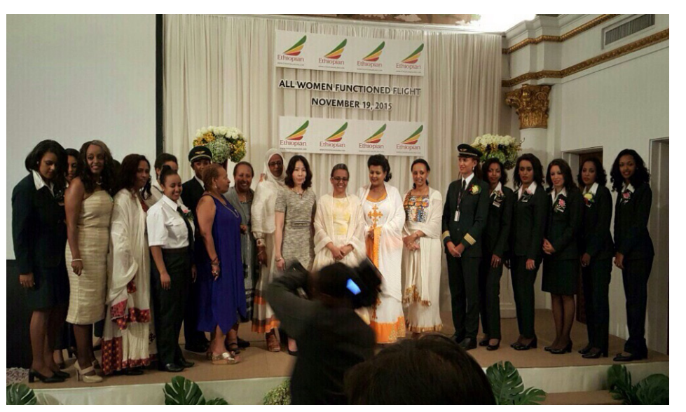
Reception event at Bangkok