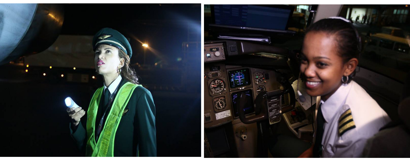
Departure from Addis Ababa