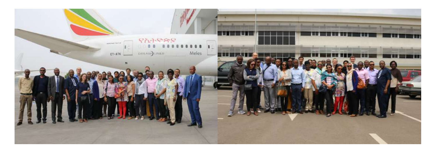
Pagumen Tour and Travel S.C staff, Addis Ababa Education Bureau Mangers, Principals and Teachers visited Ethiopian facilities