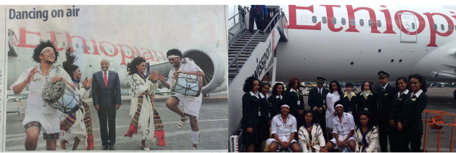
Ethiopian Dreamliner proudly landed at Dublin Airport, the first ever 787 to land in Ireland

The first service linking three continents