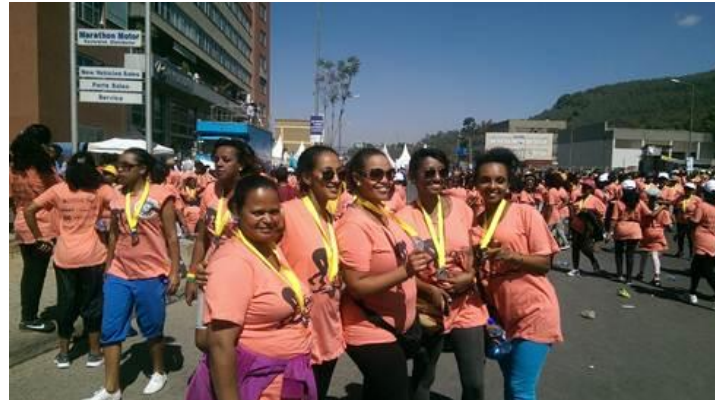
Some of Ethiopian employees at the run

Ethiopian has sponsored the 12<sup>th</sup> edition of Women First 5km Run which was held on Sunday, March 15, 2015. Ethiopian encourages its female employees to participate at different social events.