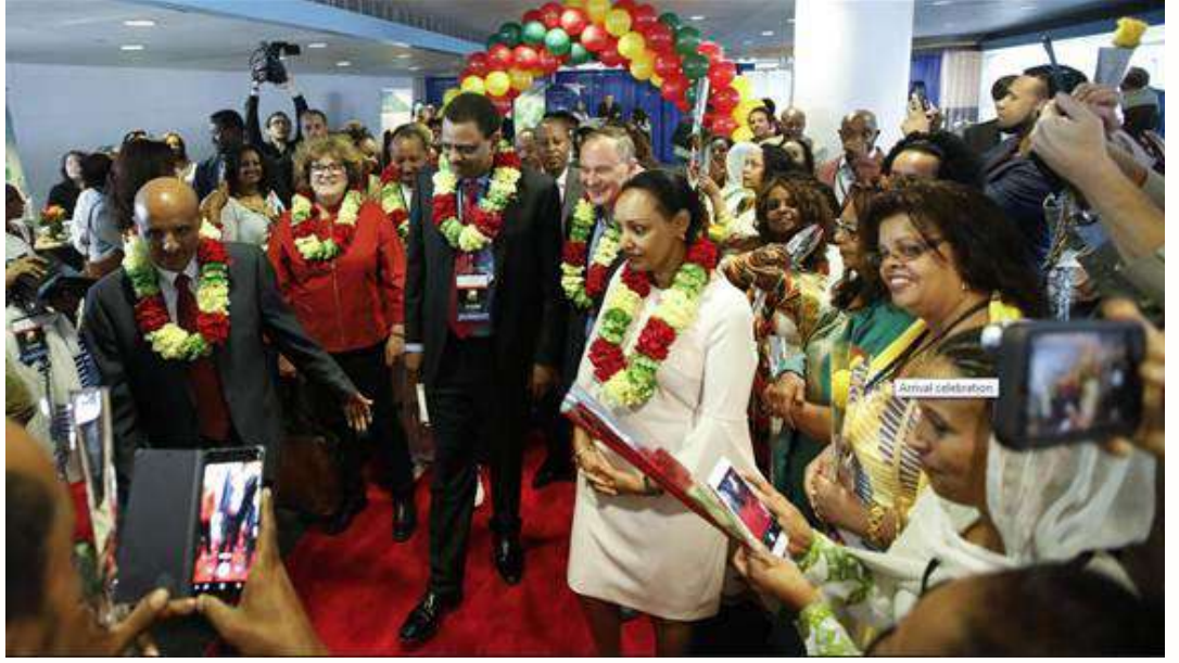
People have been waiting for VIPs to arrive and stand for photographs at O'Hare International Airport.