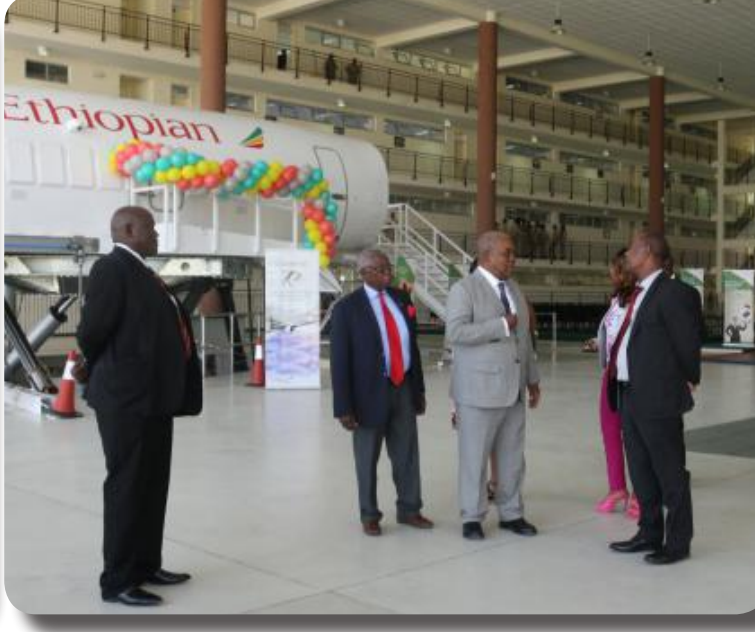
Ethiopian, the Presidential Airline, Welcomed Presidents of Tanzania, Comoros and Seychelles while arriving at Addis Ababa Bole International Airport to attend the 28th AU Summit.