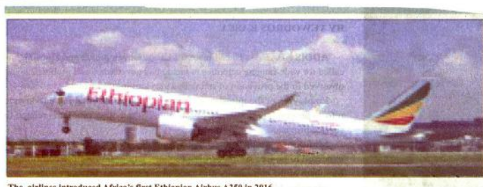
The airlines introduced Africa's first Ethiopian Airbus A350 in 2016

sa flotte de huit avions en 2016 et a terminé l'année avec 82 avions en service. Elle a diversifié sa flotte pour inclure des avions is, avec le premier A350 en Afrique.