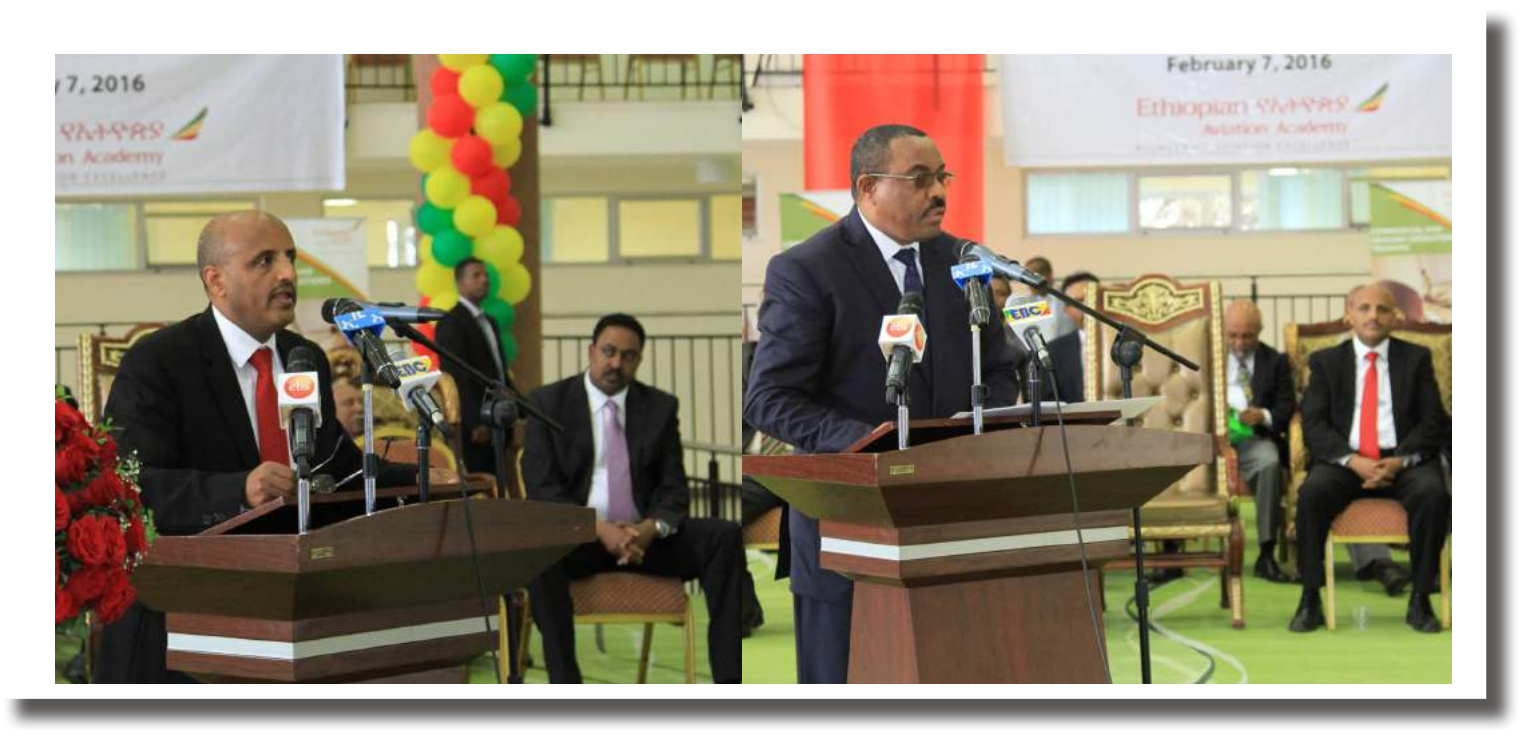
Group CEO & H.E giving a speech at the ceremony