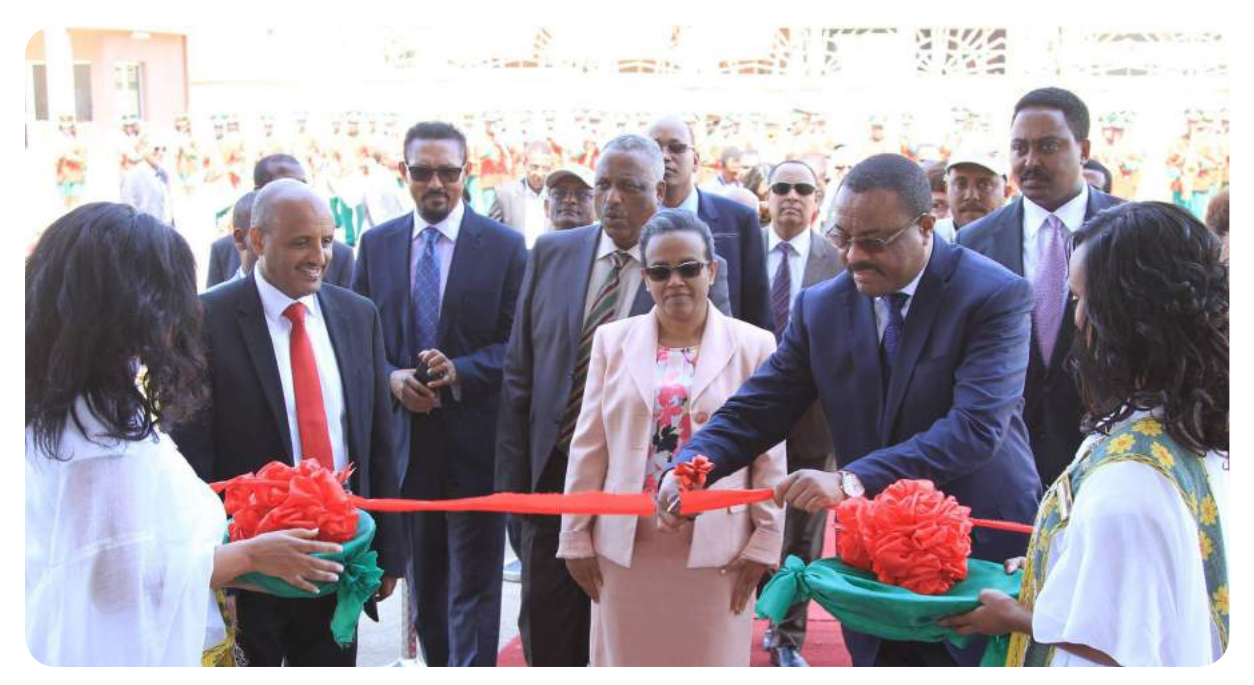
H.E. cutting ribbon to mark the ceremony of the opening of the Avaition Academy

Ethiopian Aviation Academy new facility has been officially inaugurated by H.E. Prime Minister Hailemariam Desalegn.