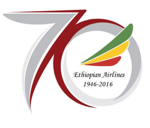
Ethiopian is ageing Beautifully!