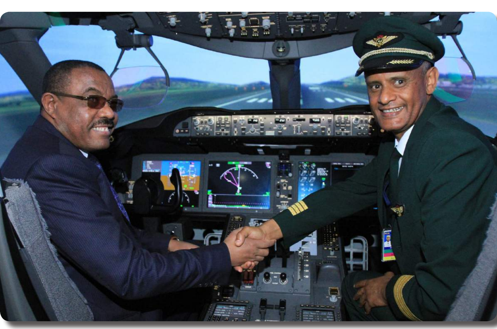
Simulator ride by the Premier