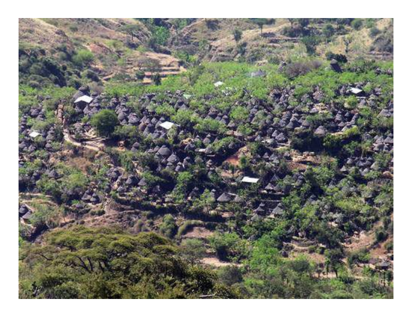
Konso Cultural Landscape

Konso Cultural Landscape is a 55km2 and property of stone walled terraces and fortified settlements in the Konso highlands of Ethiopia. It constitutes a spectacular example of a living cultural stretching back 21 generations (more than 400 years) adapted to its dry hostile environment. The landscape demonstrates the shared values, social cohesion and engineering knowledge of its communities. The site also features anthropornorphic wooden statues - grouped to represent respected members of their communities and particularly heroic events - which are an exceptional living testimony to funerary traditions that are on the verge of disappearing. Stone steles in the towns express a complex system of marking the passing of generations of leaders.