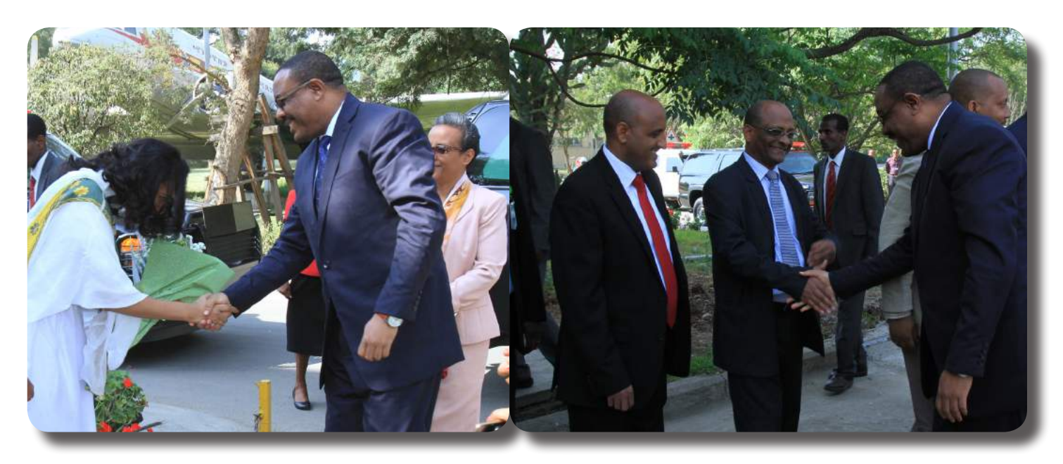
A warm welcome for H.E. Hailemariam Desalegn, Prime Minister of Ethiopia

Picture Gallery of Ethiopian Aviation Academy (EAA) Inaugural