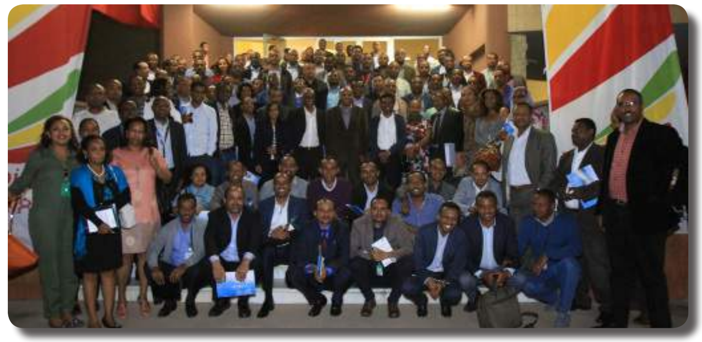
Area Manager's Group Picture