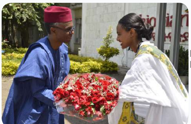
H.E. Mallam Nasir Ahmad El-Rufai, Honorable Governor of Kaduna