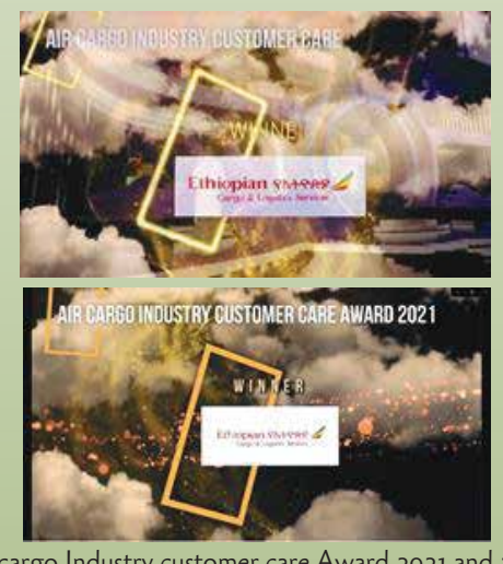
Air cargo Industry customer care Award 2021 and 2022