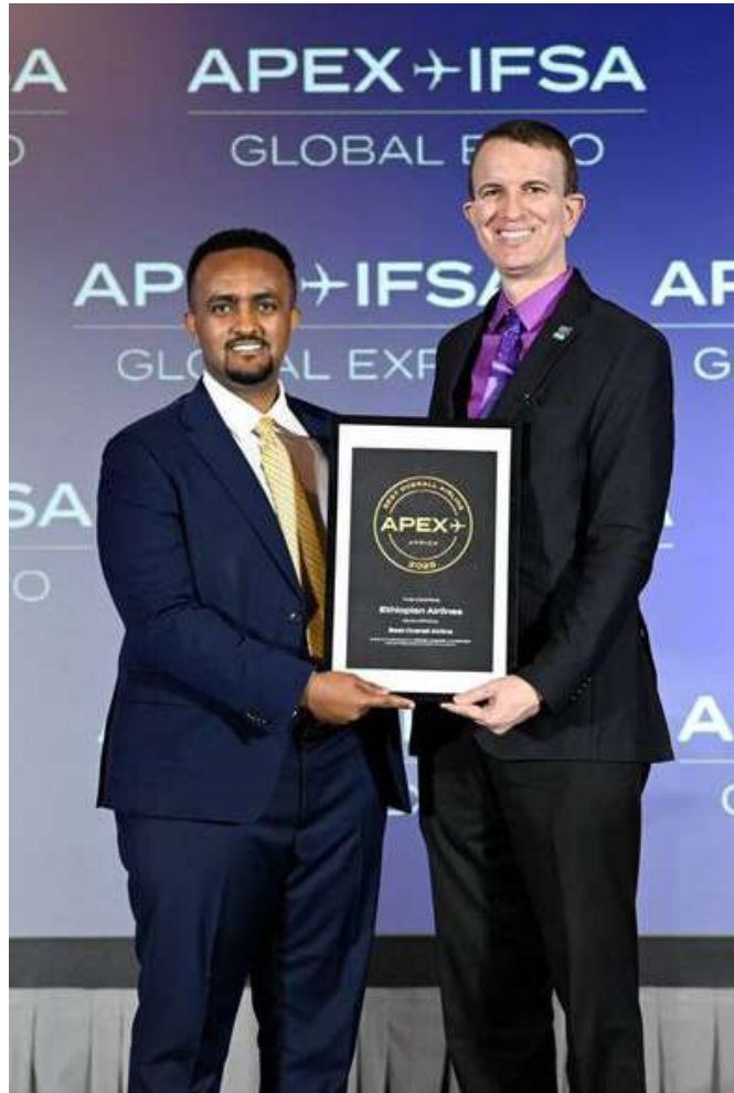
Ethiopian Airlines is pleased to announce its recognition as the winner of the 'Best Overall in Africa' at the prestigious 2025 APEX Passenger Choice Awards