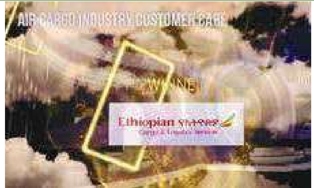
Air cargo Industry customer care Award 2021 and 2022