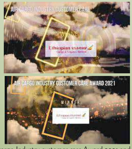
Air cargo Industry customer care Award 2021 and 2022