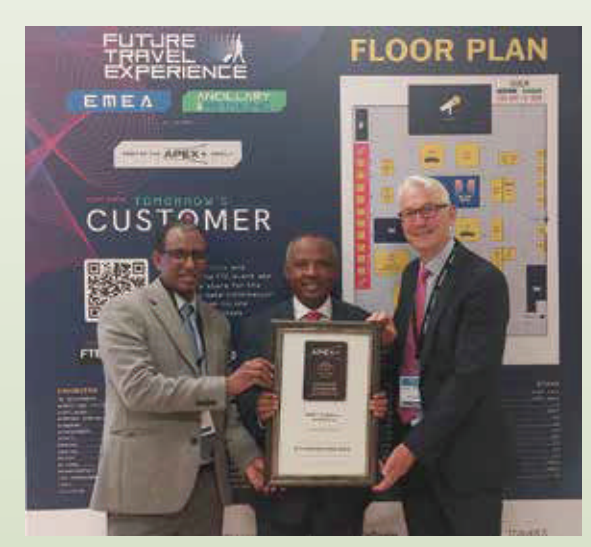
Ethiopian Airlines has been crowned as the winner of 'Best Overall in Africa' award at the 2023 APEX Passenger Choice Awards

Ethiopian Airlines has been honored with four awards at the SKYTRAX 2022 World Airline Awards including 'Best Airline in Africa' for five years in a row