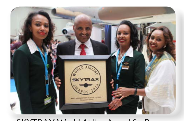
SKYTRAX World Airline Award for Best Staff Service in Africa on 18 June 2013 in Paris.