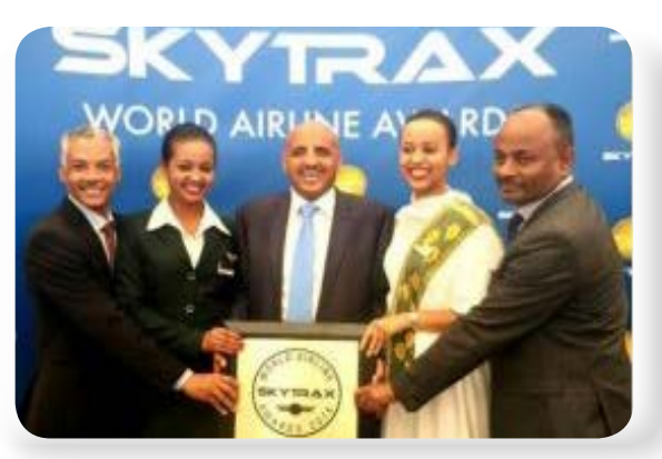
SKYTRAX World Airline Award for The Best Airline staff in Africa for the 2nd time on July 12, 2016.