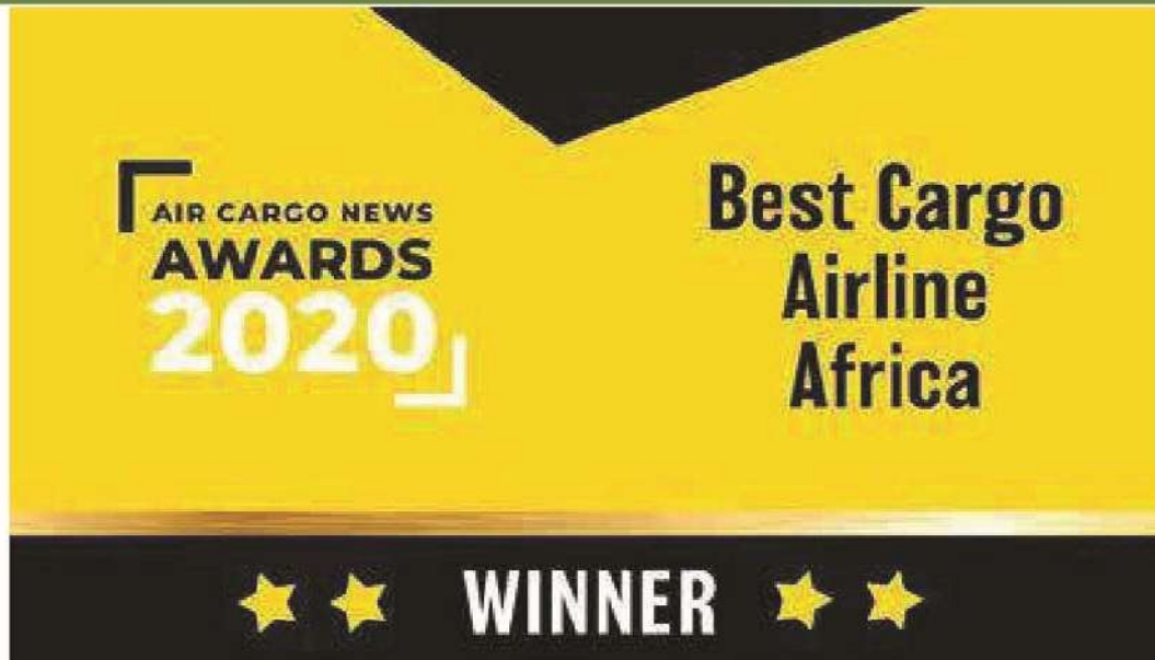
'Best Cargo Airline – Africa' Award at the Air Cargo News Awards 2020