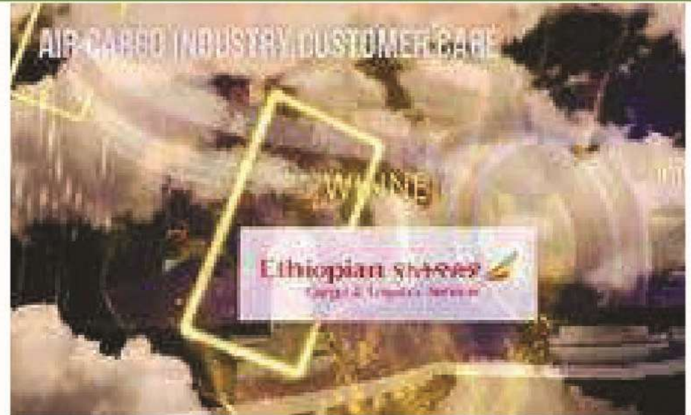
Air cargo Industry customer care Award 2021 and 2022