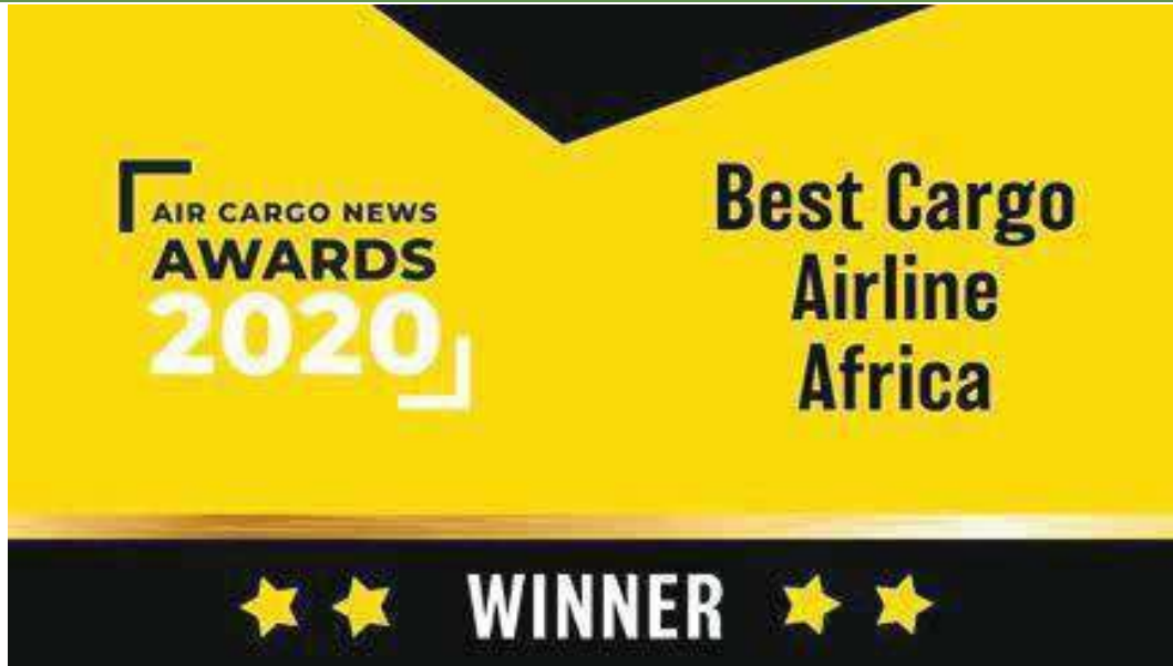
'Best Cargo Airline – Africa' Award at the Air Cargo News Awards 2020