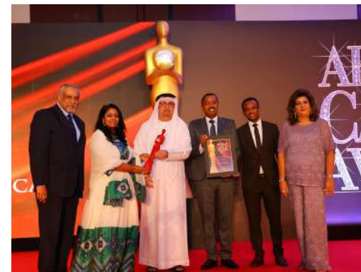
Ethiopian Cargo and Logistics Service has been honored with the "Best Cargo Airline-Africa" award for the second consecutive year at the Arabian Cargo Awards, in a ceremony held in Dubai, UAE.