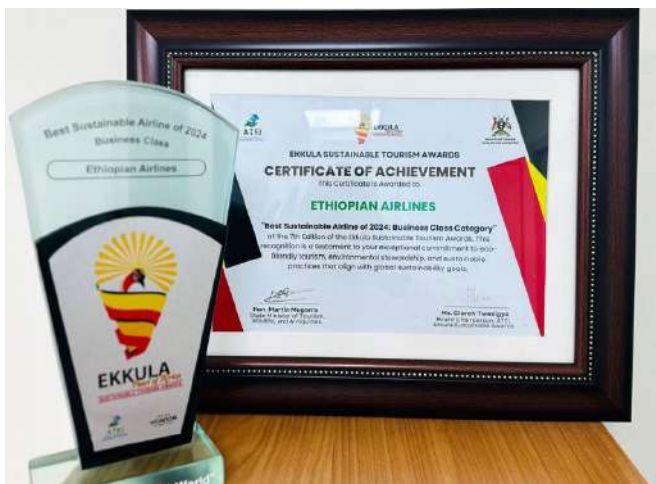
Ethiopian Airlines has been honored with the prestigious "Best Sustainable Airline of 2024-Business Class Category" award at the "Ekkula Tourism Awards 2024" in Uganda