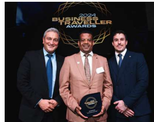
Ethiopian Airlines has been named the 'Best African Airline' at the Business Traveler Awards 2024!