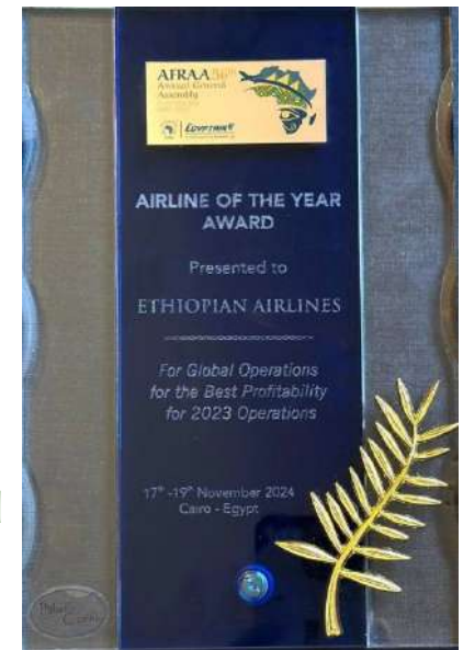
Ethiopian Airlines has been awarded "Airline of the Year - Global Operations" award at the AFRAA 56th Annual General Assembly in Cairo.