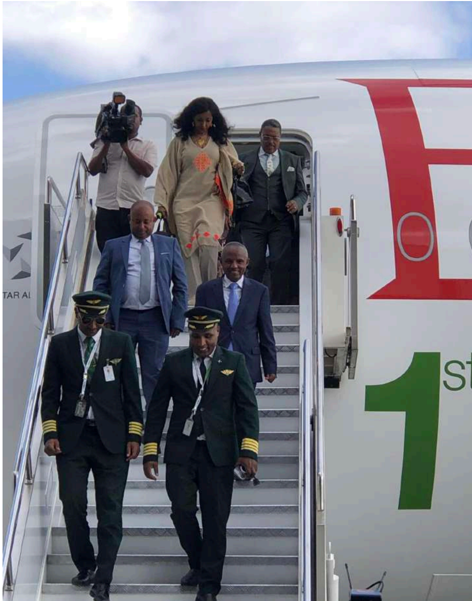
Ethiopian Airlines Welcomes Africa's First A350-1000 Aircraft