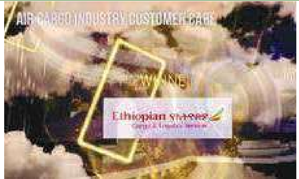
Air cargo Industry customer care Award 2021 and 2022