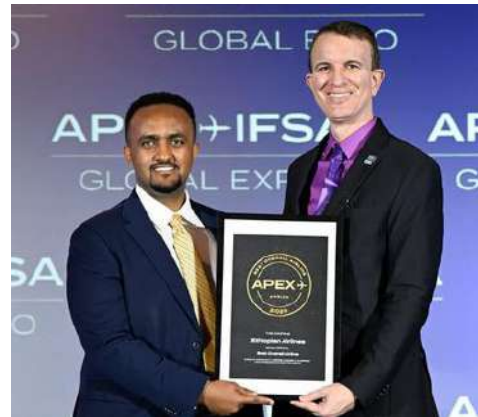
Ethiopian Airlines is pleased to announce its recognition as the winner of the 'Best Overall in Africa' at the prestigious 2025 APEX Passenger Choice Awards