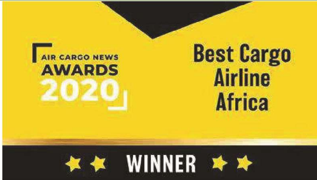
'Best Cargo Airline – Africa' Award at the Air Cargo News Awards 2020