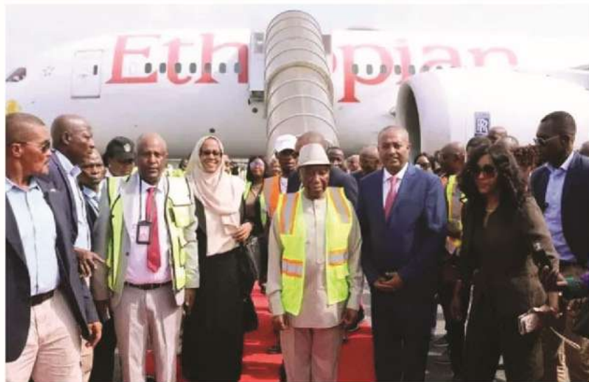
Ethiopian Airlines' inaugural flight received a warm welcome from H.E. President Joseph Nyuma Boakai, Sr., President of the Republic of Liberia, and distinguished government officials upon its arrival at Monrovia