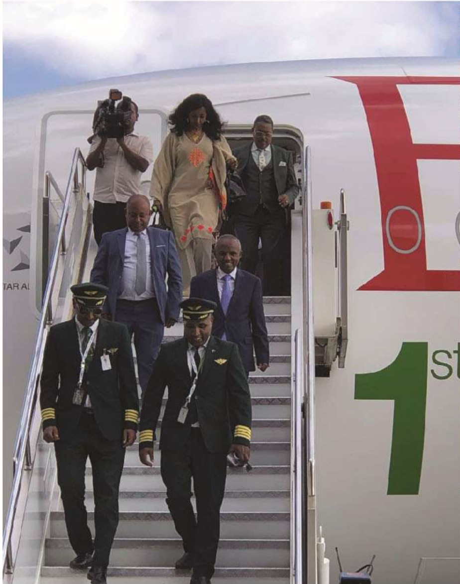
Ethiopian Airlines Welcomes Africa's First A350-1000 Aircraft