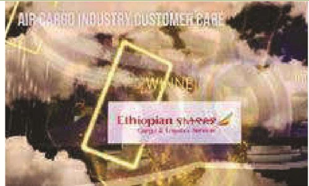
Air cargo Industry customer care Award 2021 and 2022