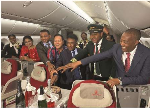
With a colourful onboard ceremony and a warm welcome, Ethiopian Airlines inaugural flight lands at Dhaka, Bangladesh.