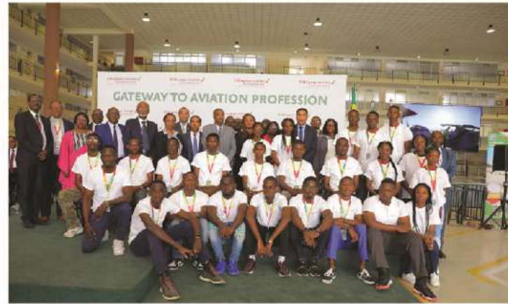
Ethiopian Aviation University is excited to welcome nearly 200 Gabonese students who will be enrolled in specialized aviation training programs.