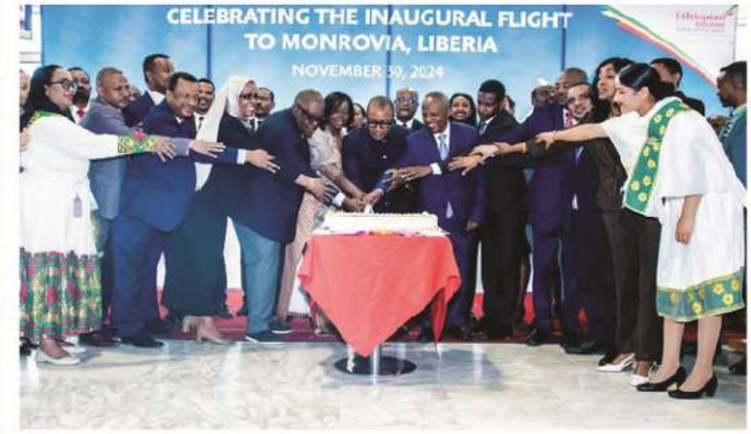
Ethiopian Airlines resumes passenger flights to Monrovia, Liberia, November 30, 2024